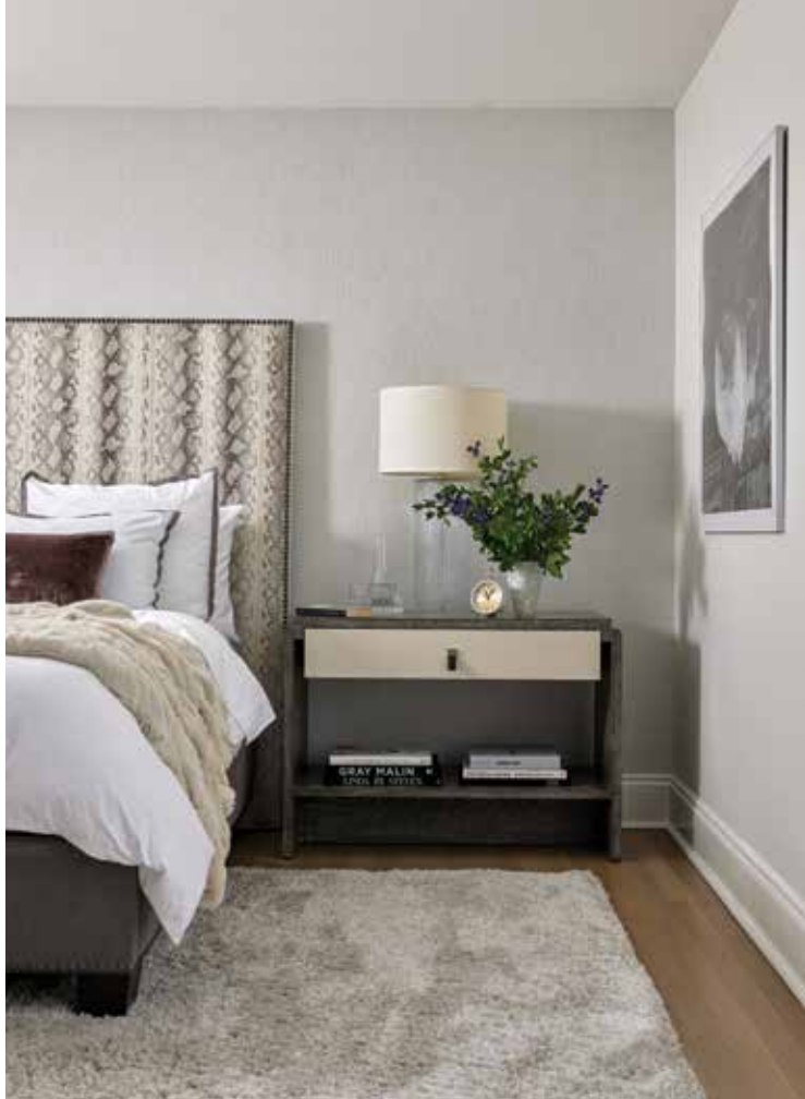
RIGHT: The primary bedroom is in the midst of a refresh, says the designer. The custom headboard is upholstered in a faux snakeskin fabric. BELOW: The adjacent bath’s custom vanity is by Prestige Cabinetry & Design. FACING PAGE: Located off the living room, the casual media room is designed for kicking back. The operative word here is comfort. The Cloud sectional is from RH and the Splash sconce is from Justice Design.

Hoffman says her design plan wasn’t overly calculated. “For me, it was more an accumula-